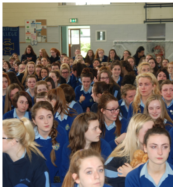
Tearful students bid a fond farewell to their teachers

It is with sadness that we bid farewell to our retirees and we wish them happiness and fulfilment in the years ahead.